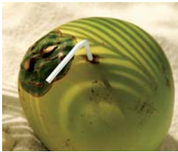
Coconut Scraping Competition! for adults: Scrape coconuts like a Papua New Guinean (includes course)

Polynesian Dance performed by dancers from Germany