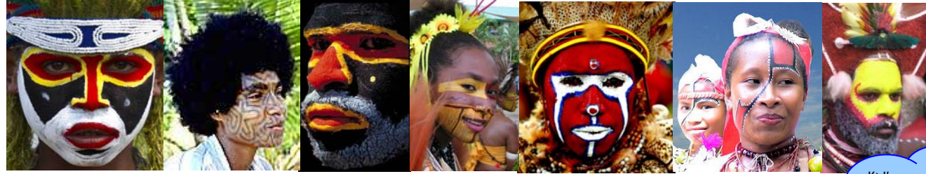
Tribal Face Painting! Adults & kids: a choice of Papua New Guinean tribal faces