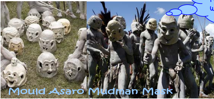
Mould Asaro Mudman Mask

A mini City Tour Saturday 9-13pm for who is interested! 5 Euro for ticket cost